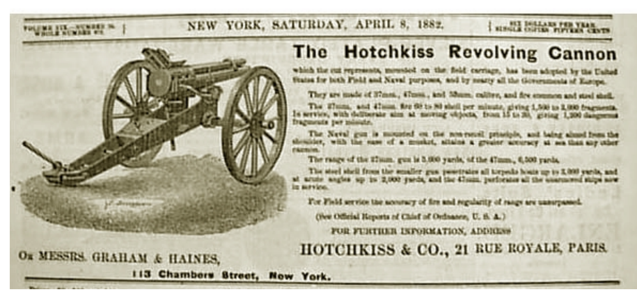
Figure 1.3. Hotchkiss Revolving Cannon

Ideologies of US settler colonialism directly informed Australian settler colonialism. South African apartheid townships, the kill-zones in what became the Philippine colony, then nation-state, the checkerboarding of Palestinian land with checkpoints, were modeled after U.S. seizures of land and containments of Indian bodies to reservations. The racial science developed in the U.S. (a settler colonial racial science) informed Hitler's designs on racial purity ("This book is my bible" he said of Madison Grant's The Passing of the Great Race). The admiration is sometimes mutual, the doctors and administrators of forced sterilizations of black, Native, disabled, poor, and mostly female people - The Sterilization Act accompanied the Racial Integrity Act and the Pocohontas Exception - praised the Nazi eugenics program. Forced sterilizations became illegal in California in 1964. The management technologies of North American settler colonialism have provided the tools for internal colonialisms elsewhere.