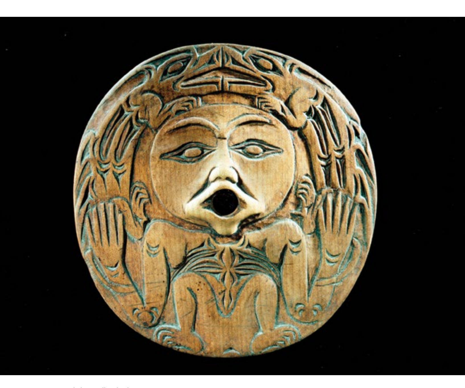
Coast Salish spindle whorl, ethnology collections, RBCM 2454.