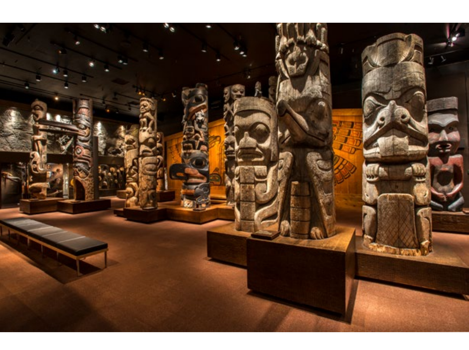
The Totem Hall at the RBCM.